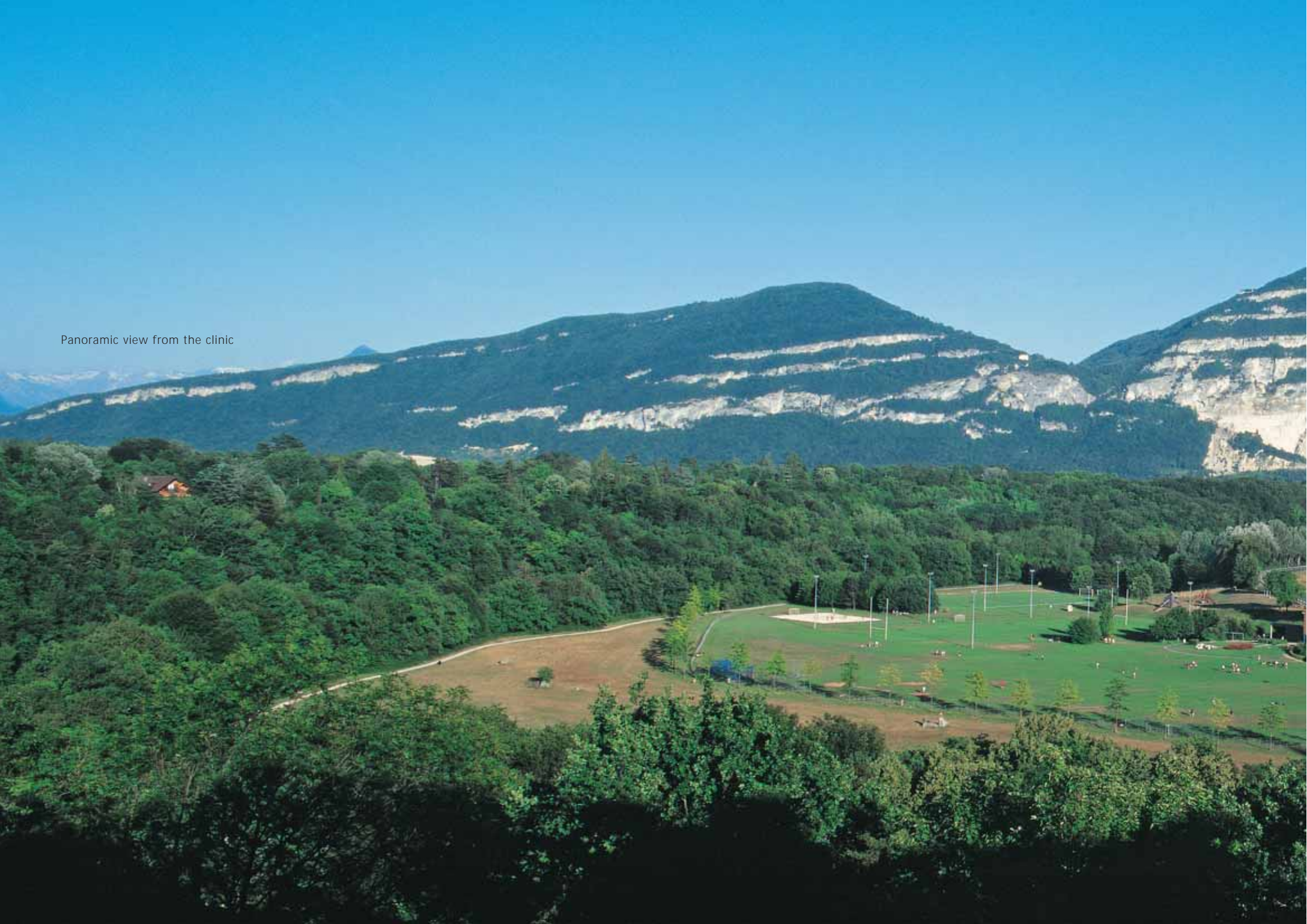
Panoramic view from the clinic