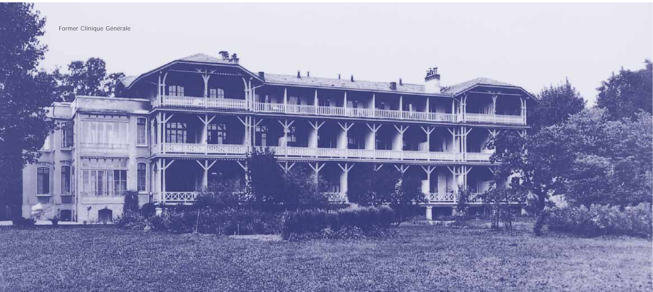
Former Clinique Générale